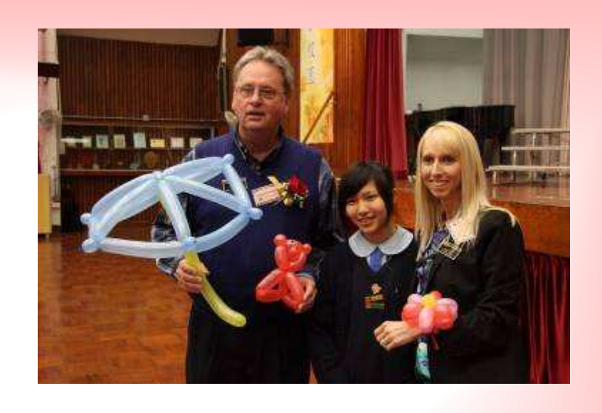
Souvenir made by the students