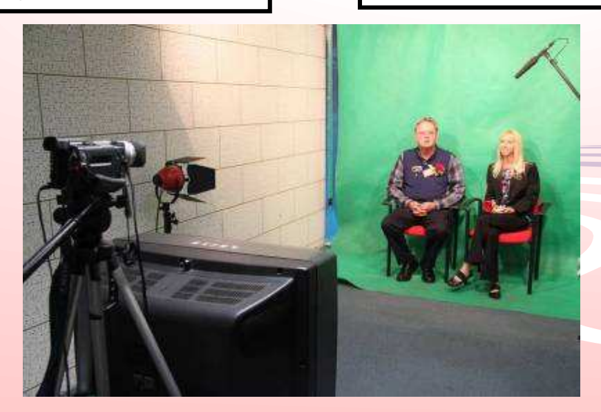
Visiting the 3-D virtual studio