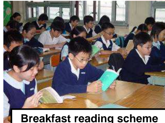
Breakfast reading scheme