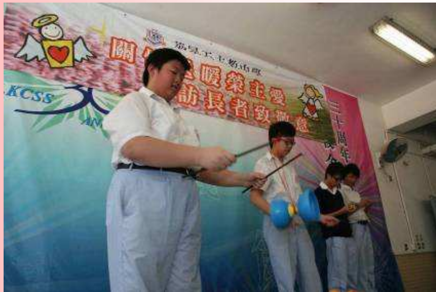
Lai King Talent Show