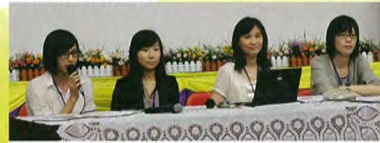
Our teachers' sharing

In this programme, some of our teachers joined co-teaching sessions in which they had the chance to co-plan lessons beforehand with teachers from other schools. The co-teaching lessons were productive and fruitful. Also, these peer lesson observations gave us the opportunity to try out new teaching aids and approaches and gain in-class experience from observing others' lessons. Such programmes foster strong bonds among our teachers and a greater sense of unity and professionalism.