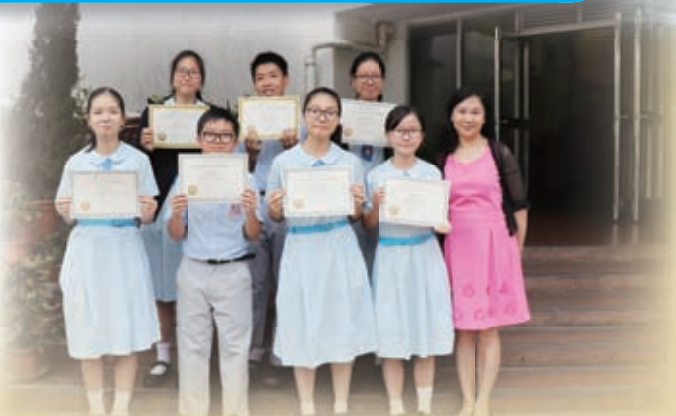
S2 TOEFL Junior High Achievers