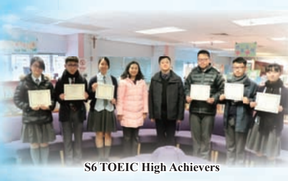
S6 TOEIC High Achievers