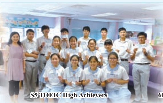
S5 TOEIC High Achievers