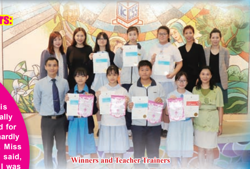
Winners and Teacher Trainers