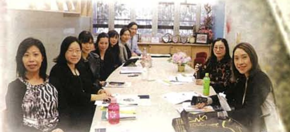
S.5 and S.6 English teachers meeting with TOEIC consultants

A result analysis meeting, joined by all S5 and S6 teachers as well as two TOEIC consultants, was held on 16th December, 2019 to evaluate our students' TOEIC exam performance. Meaningful feedback about the students' strengths and weaknesses in the Reading and Listening papers has been given to our school to boost our students' English proficiency. It is hoped that all LKCSS students can effectively improve their English language skills and become more comfortable and confident in using English.