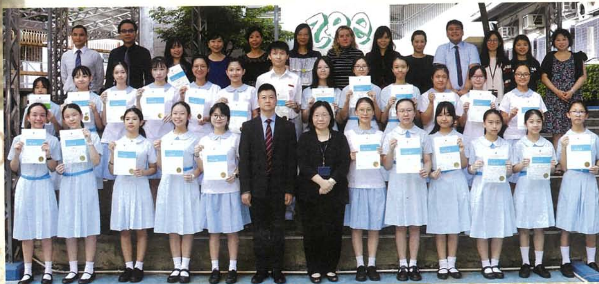
Speech Festival winners and English teachers