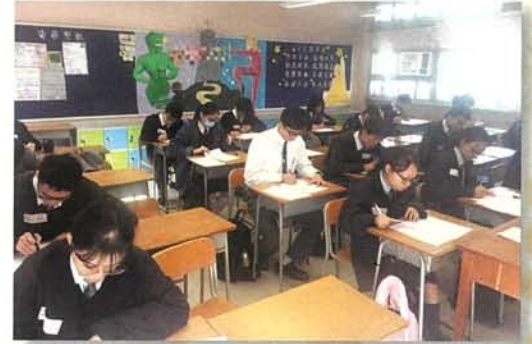
Students in the preparation room

On 14th December 2019, 30 S.6 students from our school participated in a joint-school speaking practice at our school. Together with over a hundred students from 6 other Hong Kong Catholic Diocesan Secondary Schools, our students were actively engaged in group discussions and individual responses in a setting very much resembling the HKDSE speaking exam. Practical comments from teachers were given to all participants. This activity provided students with a platform to sharpen their English speaking and communication skills.