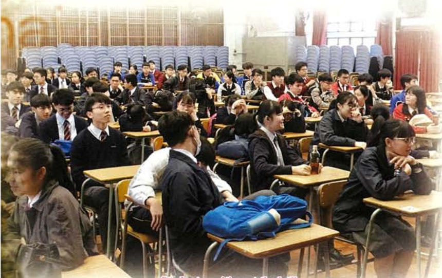
Students waiting at the hall

to better understand their strengths and weaknesses and to improve themselves. Most of the participating students were eager to speak and showed appreciation of having the chance to receive valuable advice from the assessors. Many agreed that they have become more confident in speaking English in front of strangers in an exam setting.