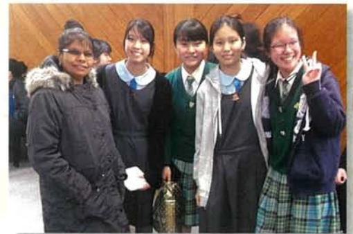
Our students with other exchange students