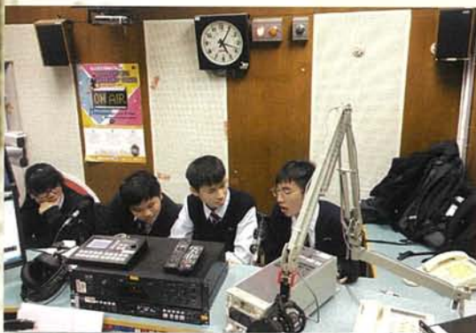
Students in a studio

They took part in an enjoyable recording session to share their opinions in English on a topic of their choice: The Trolley Problem. Imagine there was an unstoppable train going towards a junction which led to two different ends. At one end, there was one person being strapped onto the side track while at the other end, five persons were being strapped onto the main track. You had to decide which way the train would go.