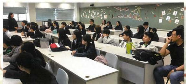
Briefing session before departure

All the participants received a tour book. The book contained important information of the tour like the flight and accommodation info, the itinerary and some travel tips. What's more, there were different tasks for each tourist spot, like filling in a fun fact sheet about Singapore's history, drawing the Merlions, designing a mascot for Hong Kong and writing reflections on their Pandan Chiffon Cake Baking Class, etc. Students had to complete all the tasks throughout the tour.