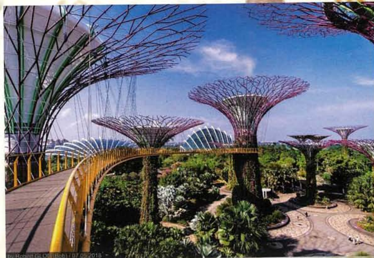
Gardens by the Bay Singapore

Gardens by the Bay was by far the most breathtakingly beautiful attraction that both teachers and students enjoyed. Inside we were able to see two famous attractions: the Cloud Forest and the Flower Dome which literally took our breath away. There was something truly magical about it when you walked in and saw all of the plants and flowers. There, you really felt like you were in a different world and time had stopped. Students had to find certain plants and flowers based on the riddles given in their tour books and then answer some questions about the plants, for example, how cacti defend themselves from predators.