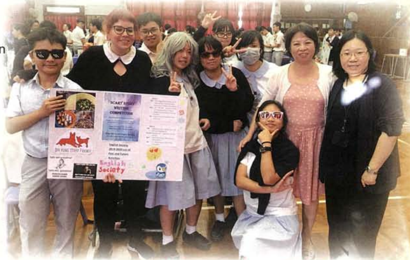
Recruiting new English Society members at ECA Clubs Promotion Fair