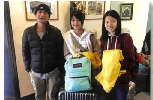
Our students with their host family

Over the weekends, our students were arranged to visit some famous tourist attractions and beautiful sceneries to further explore the New Zealand landscape.