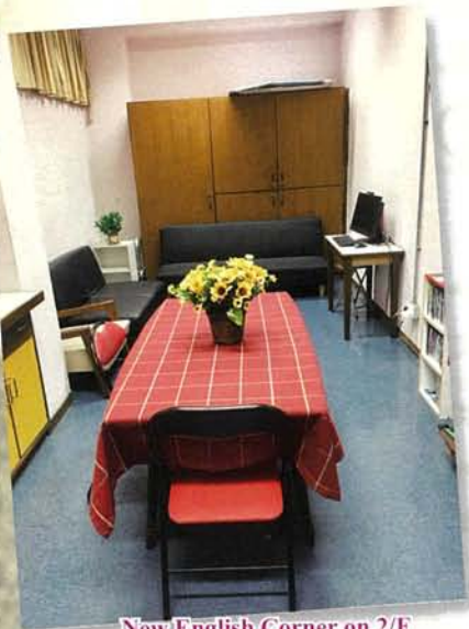
New English Corner on 2/F

As for the second game, Guess that English Idiom, students lined up, drew a piece of paper out of a box and looked for the corresponding English idiom. When they had decided on their answer, they would throw a bean bag at the English idiom picture and read the idiom aloud. One example is the idiom "Bring home the bacon", which means to earn money.