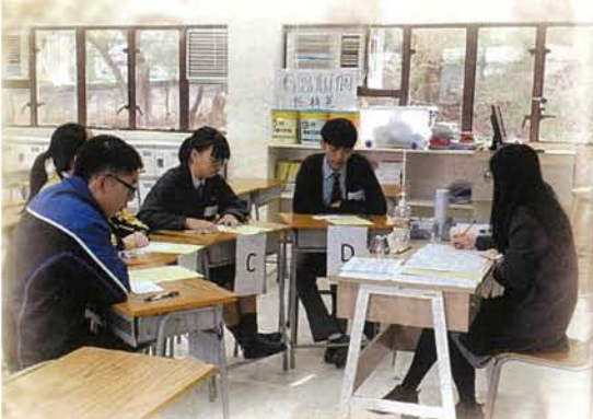
Students conducting a group interaction session