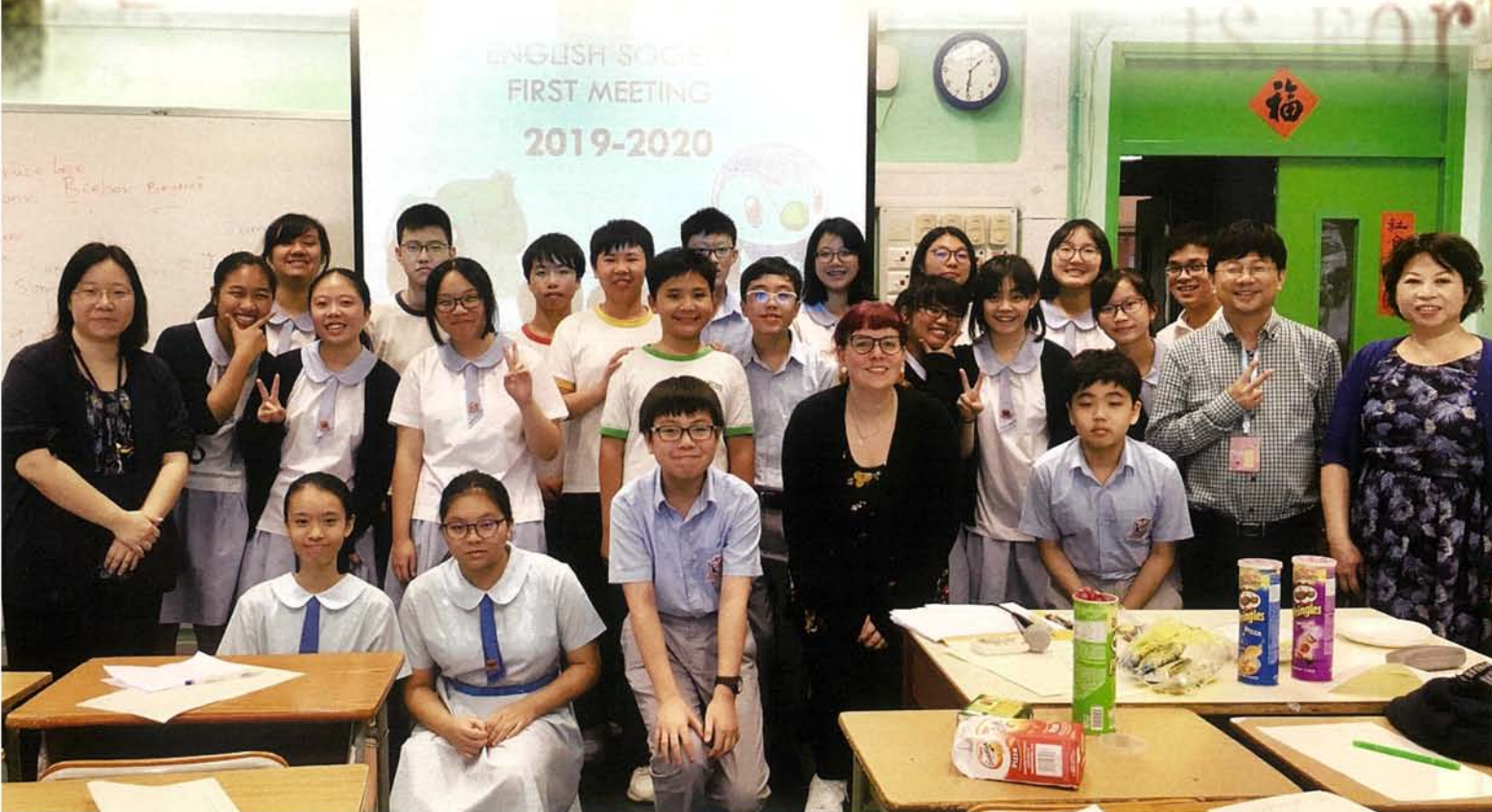
First English Society Meeting