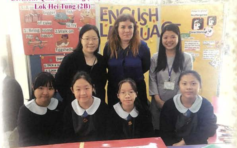
Teachers and helpers on School Open Day