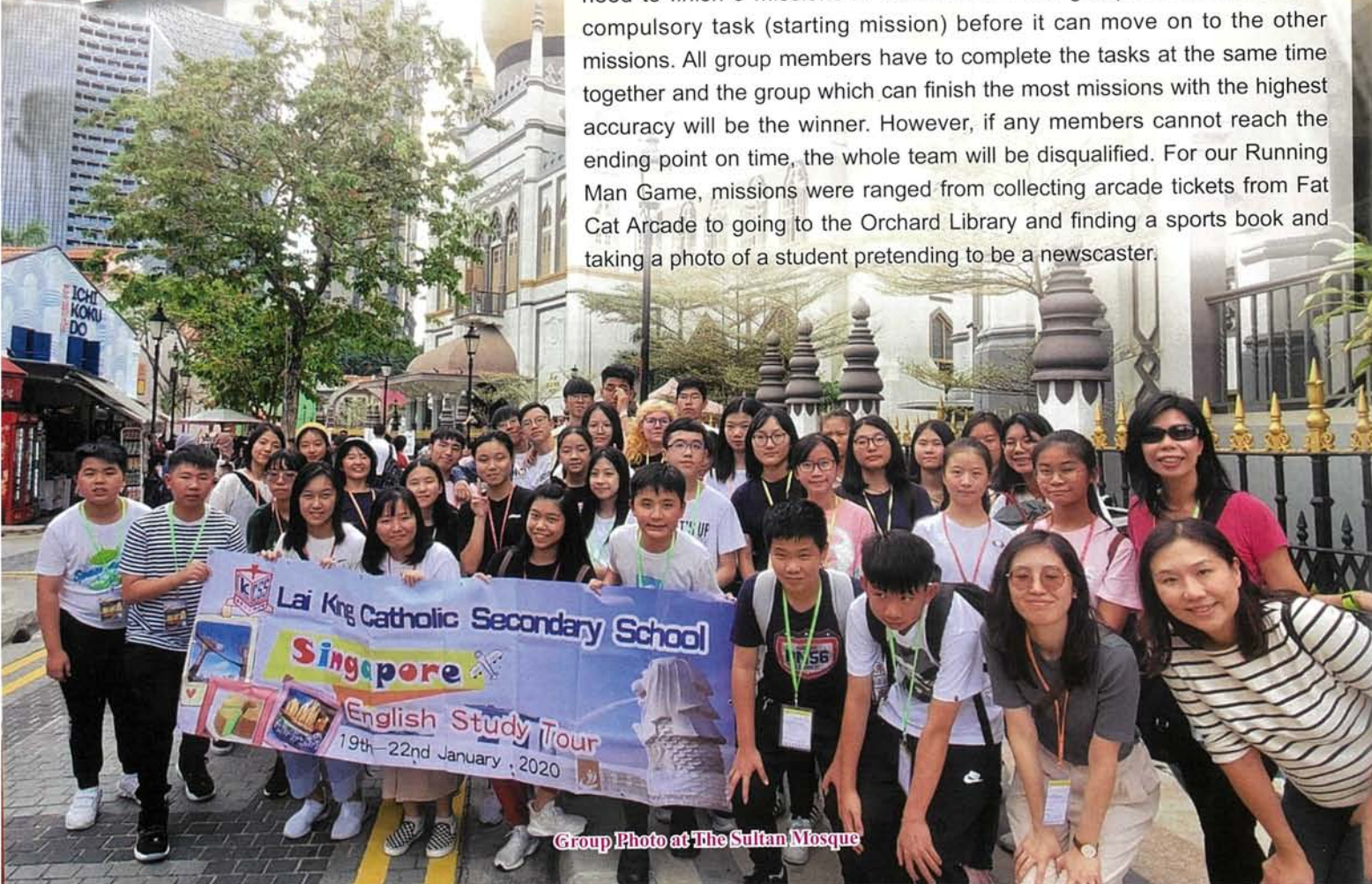
Group Photo at The Sultan Mosque